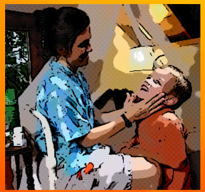
Do not spray on their face! Spray on your hands and then apply to their face.

Jess called NPIC and learned the label has age restrictions and says how often to apply a repellent.